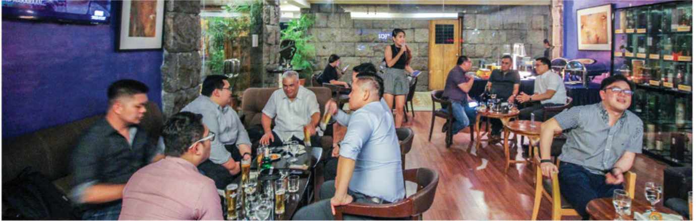
Oktoberfest Live Entertainment (Bistro Lounge)