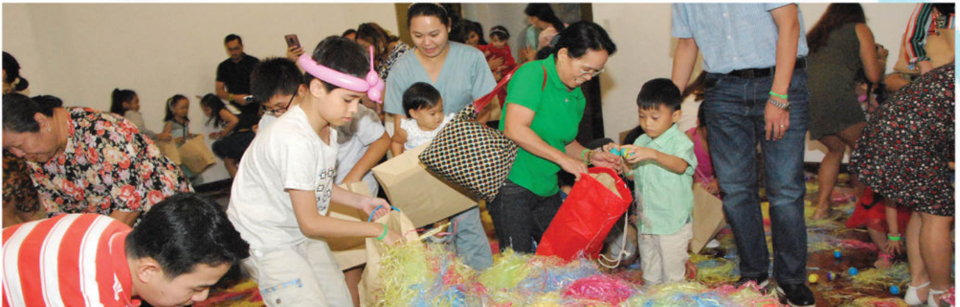
Easter Sunday Celebration (Ayala Banquet Hall)