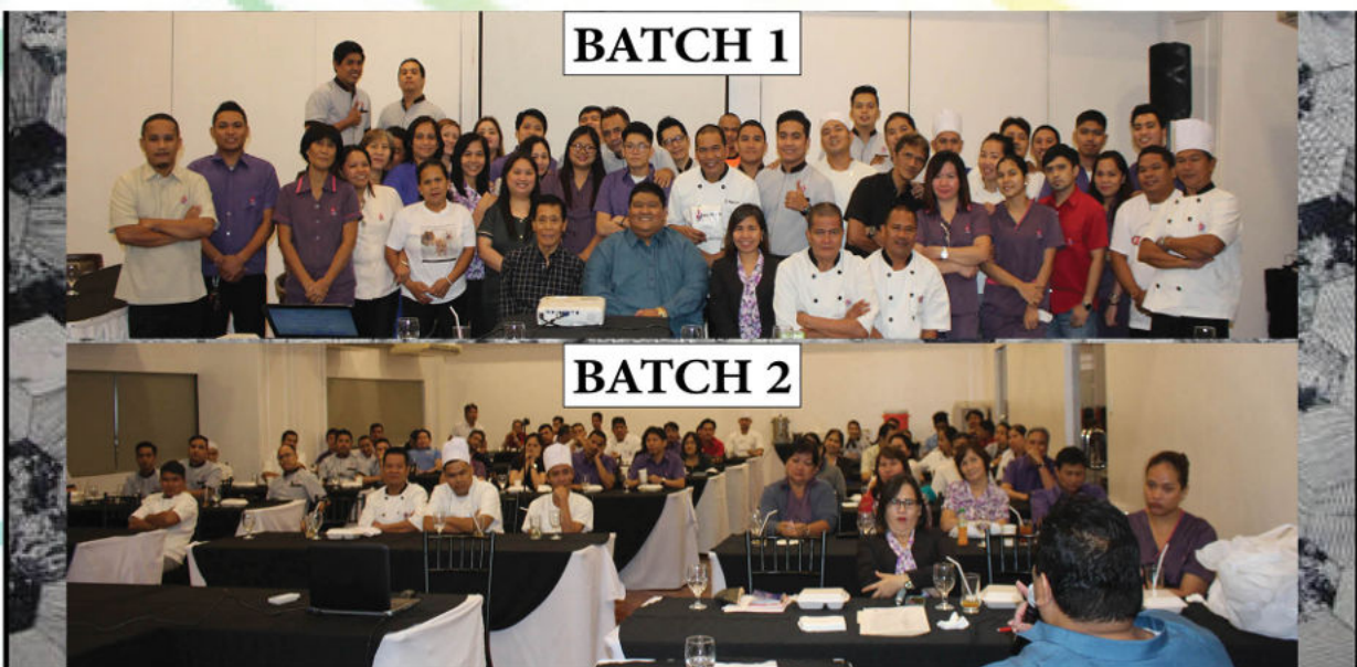
Re-Orientation of all Regular Employees