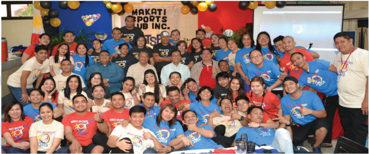
Employees' Sports Fest held last July 2018