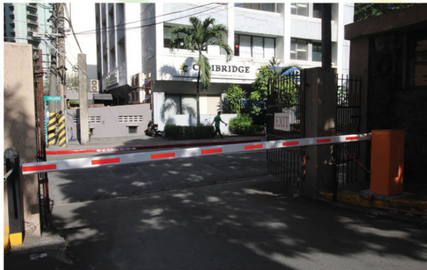
Automatic Lane Barrier