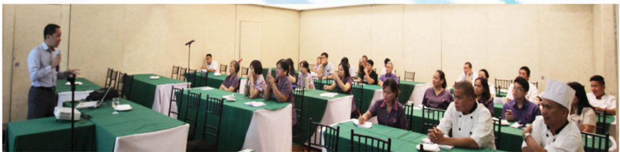
Financial & Wellness Seminar