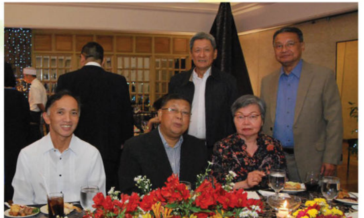
Members' Thanksgiving Cocktails