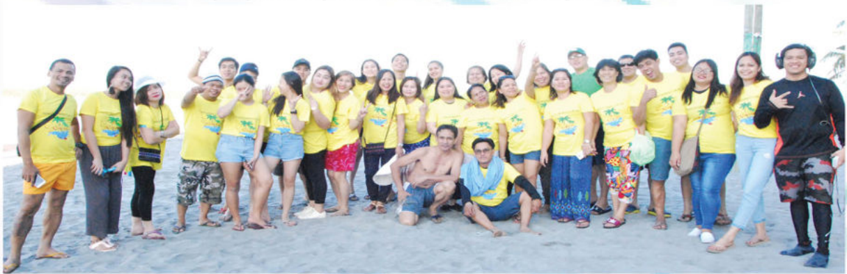
MSCI Employees' Summer Outing held last April 2018