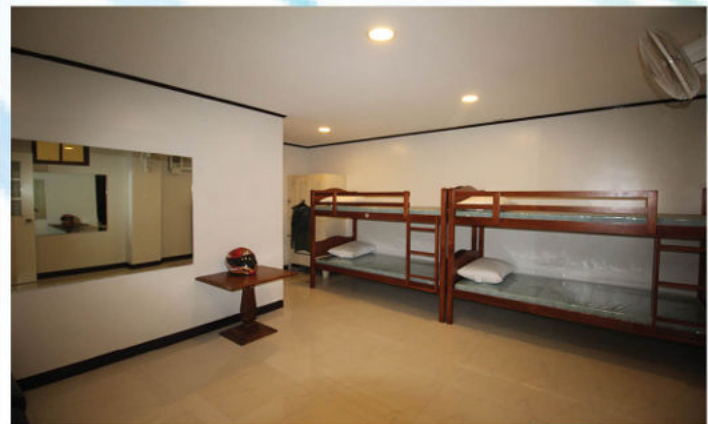
Managers' & Supervisors' Lounge