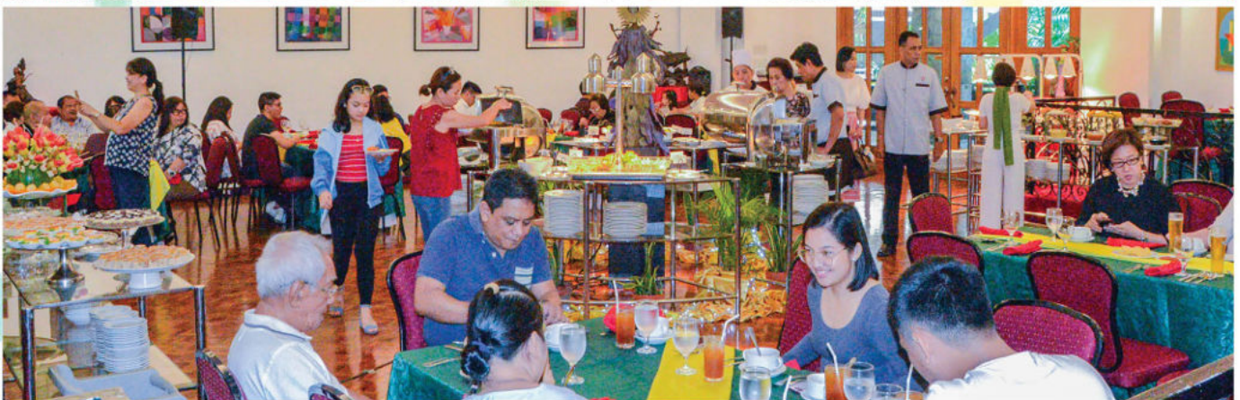
Father's Day (Zobel Dining Room)