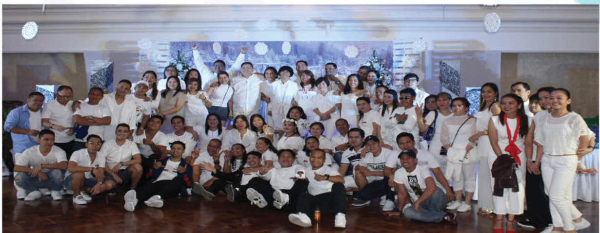
MSCI Christmas Party