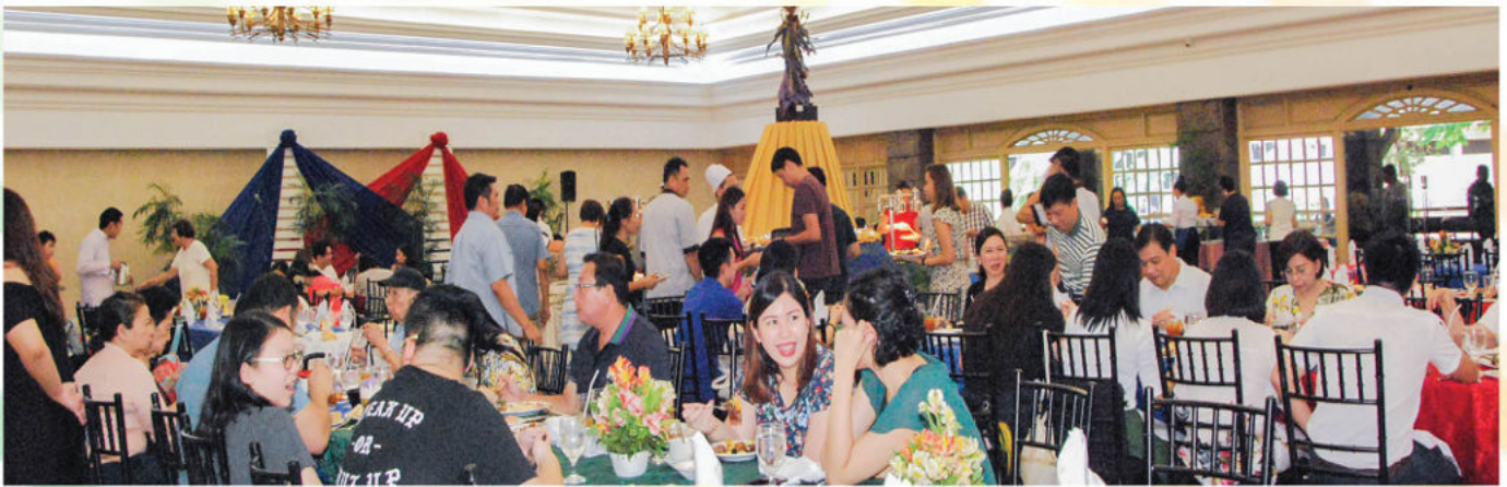
Mother's Day (Zobel Dining Room)