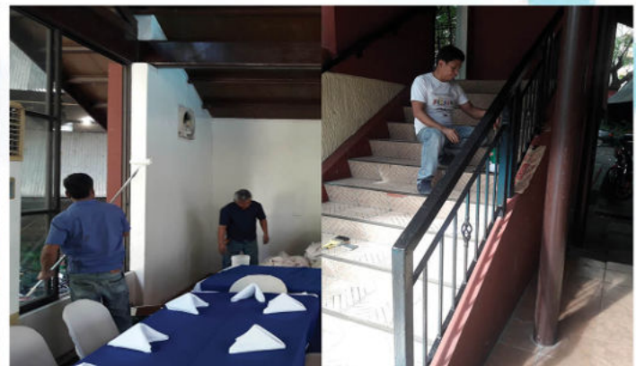
Repainting of Function Rooms