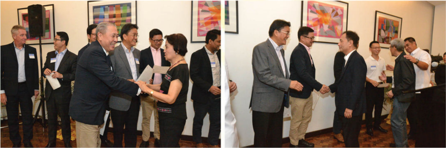
August 17, 2018