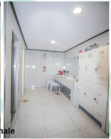
Employees' Locker Rooms