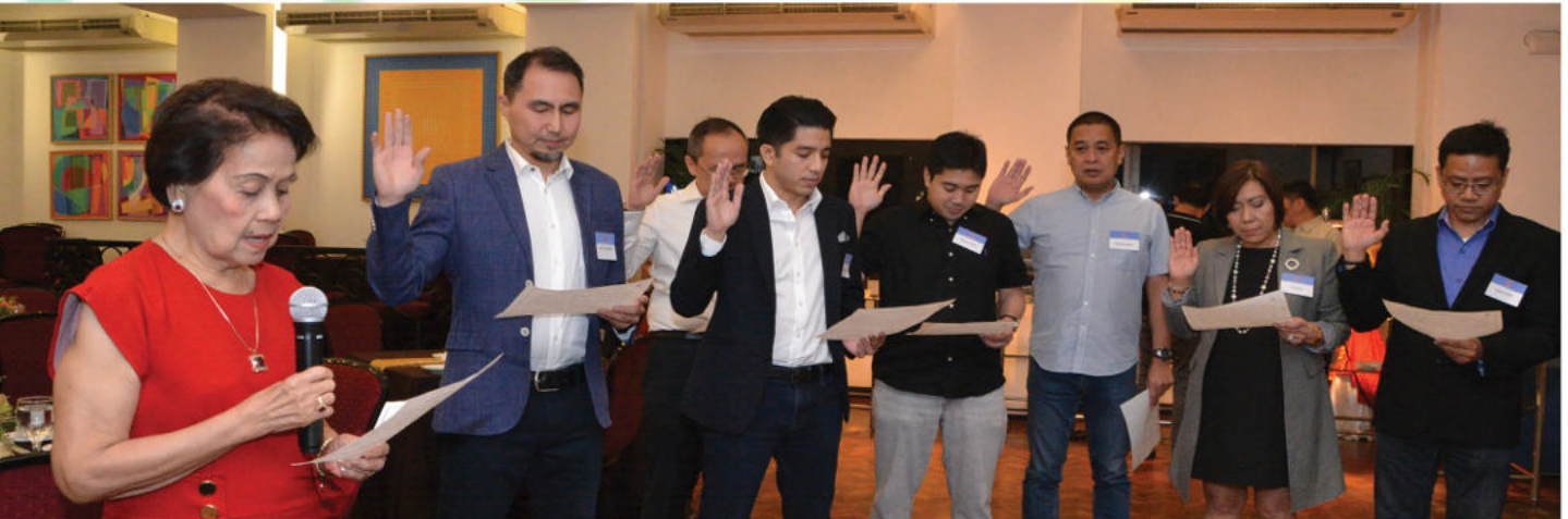
February 15, 2019