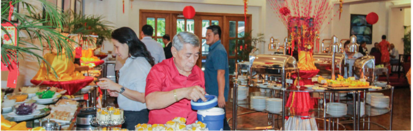
Chinese New Year Celebration (Zobel Dining Room)