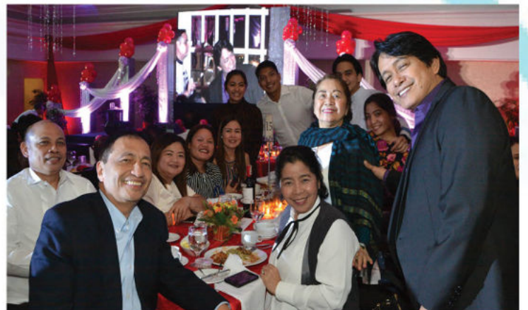
Valentine's Dinner Concert