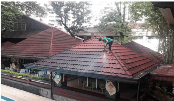
Pressure Washed Poolside Cabin Roof