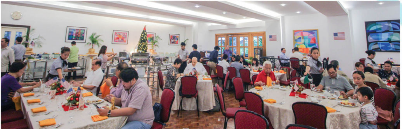
American Thanksgiving Lunch (Zobel Dining Room)