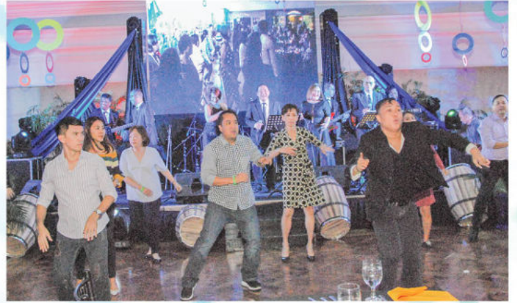
Oktoberfest Grand Concert